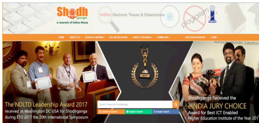
Shodhganga ( http://shodhganga.inflibnet.ac.in/ )

The Shodhganga @ INFLIBNET Centre is set-up using DSpace, an open source digital repository software, initially developed by MIT and HP, now updated and maintained by DuraSpace, a non-profit Organisation. The DSpace uses internationally recognized protocols and interoperability standards. The Shodhganga @ INFLIBNET Centre provides a platform for research scholars to deposit their Ph.D. theses and make it available to the entire scholarly community in open access. The repository has the ability to capture, index, store, disseminate and preserve ETDs submitted by the researchers.